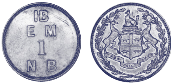
Examples of early Canadian coins. National Currency Collection, Bank of Canada; Photography James Zagon, Ottawa.