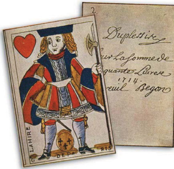
50 livres, French Regime playing card money – Reproduction, 1714, Canada.

To review – money is a “medium of exchange” (we use it for spending), a “store of value,” (we use it for saving and investing), and a “unit of account,” (it enables us to set all prices in terms of money.)